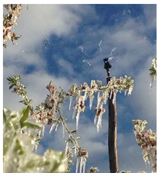
Figure 5: Over-plant sprinkler

Over-plant sprinkler irrigation is used to protect low-growing crops and deciduous fruit trees with strong scaffold branches that do not break under the weight of ice loading. Even during advection frosts, overplant sprinkling provides excellent frost protection down to near -7 °C if the application rates are sufficient and the application is uniform. Under windy conditions or when the air temperature falls so low that the