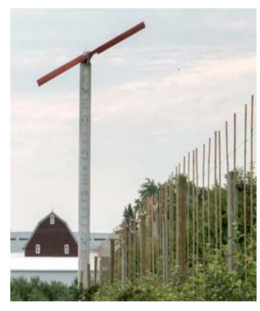
Figure 3: Wind machine.